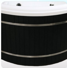
Stainless Steel Banding